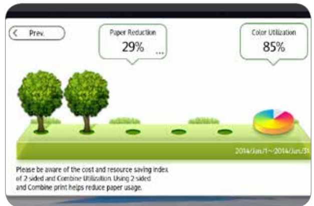
Eco-Friendly Indicator Screen as shown on Smart Operation Panel.

We strive to be stewards for the environment. That's why we give you more ways to take responsibility for your own energy and paper use. The Savin MP C401/MP C401SR offers expanded energy-saving modes to reduce power consumption. Program it to shut down or power up automatically to conserve energy during expected downtimes. Take advantage of standard duplexing to reduce paper and associated costs. Set print quotas for individual users or groups to reduce unnecessary printing. And, use the built-in Eco-Friendly Indicator to see how much paper your team is saving. These models meet the new stringent standards for ENERGY STAR™ 2.0 certification and have qualified for an EPEAT® gold rating.