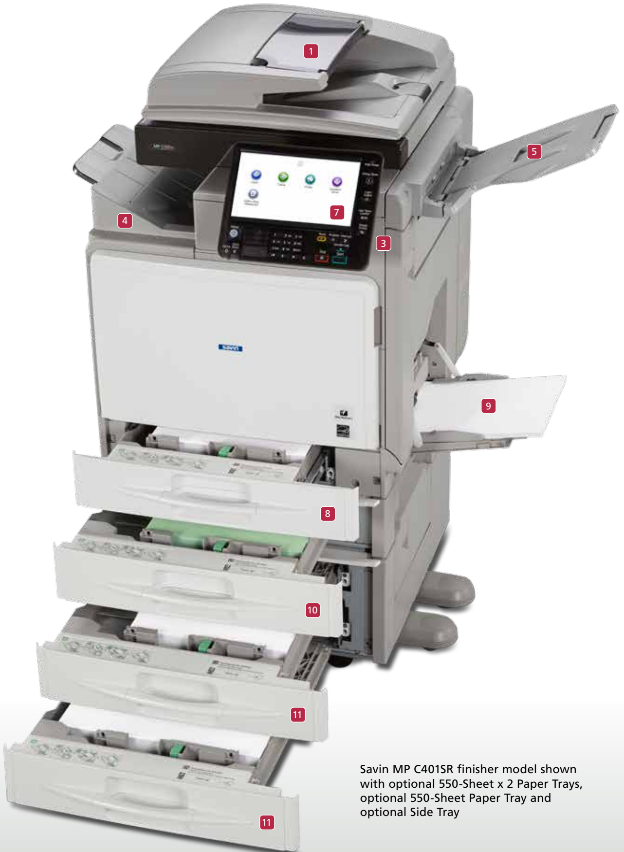
Savin MP C401SR finisher model shown with optional 550-Sheet x 2 Paper Trays, optional 550-Sheet Paper Tray and optional Side Tray